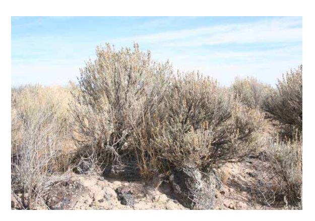
Figure 3 . Wyoming big sagebrush.

Basin big sagebrush usually occurs at the lowest elevational range of the species, being most abundant in the valley bottoms to mountain foothills. Plants typically have a single main trunk and may grow to a height of 4 m (13 ft) under proper conditions, making basin the largest subspecies. Basin big sagebrush plants are generally uneven-topped with loosely branching flowering stems distributed throughout the crown (see figure 1). Floral heads typically contain 3 to 6 small flowers per head. Leaves of the vegetative stems are narrowly cuneate averaging 2 cm (0.8 in) or more and can be as long as 5 cm (2 in) being many times longer than wide (see figure 2). Ultraviolet visible coumarins in leaf extracts are minimal: leaf UV color is none to light blue in water and a rusty red-brown color in alcohol. 2n = 18 or sometimes 36.