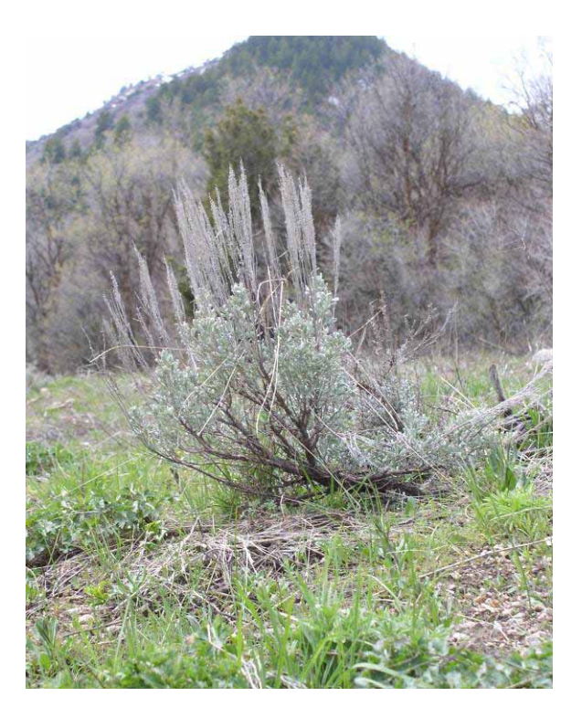
Figure 4 . Even topped mountain big sagebrush.

The vegetative stems of mountain big sagebrush create a characteristic even topped crown with the panicles rising distinctly and relatively uniformly above the foliage (see figure 3). Plants are normally smaller than those of basin big sagebrush, averaging about 0.9 m (3 ft) tall. Inflorescences are narrow and spicate bearing flower heads containing 4 to 8 flowers per head. Leaves are characteristically wider than those of basin or Wyoming big sagebrush. In extracts, ultraviolet visible coumarins are abundant. Leaf extracts fluoresce blue in water and blue-cream in alcohol. 2n = 18 or sometimes 36.