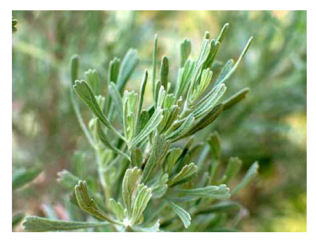
Figure 2 . Leafy stem of basin big sagebrush.

detailed review of the characters for the subspecies occurring in the Intermountain West.