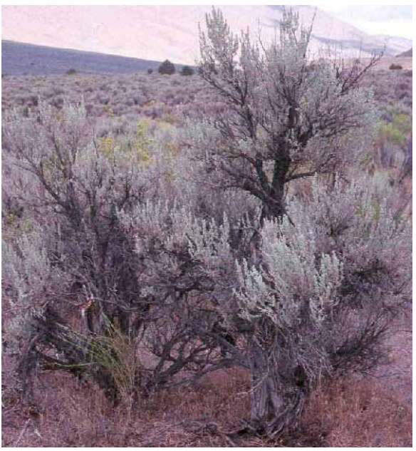
Figure 1. Basin big sagebrush (Artemisia tridentata ssp. tridentata).

Contributed by: USDA NRCS Idaho State Office