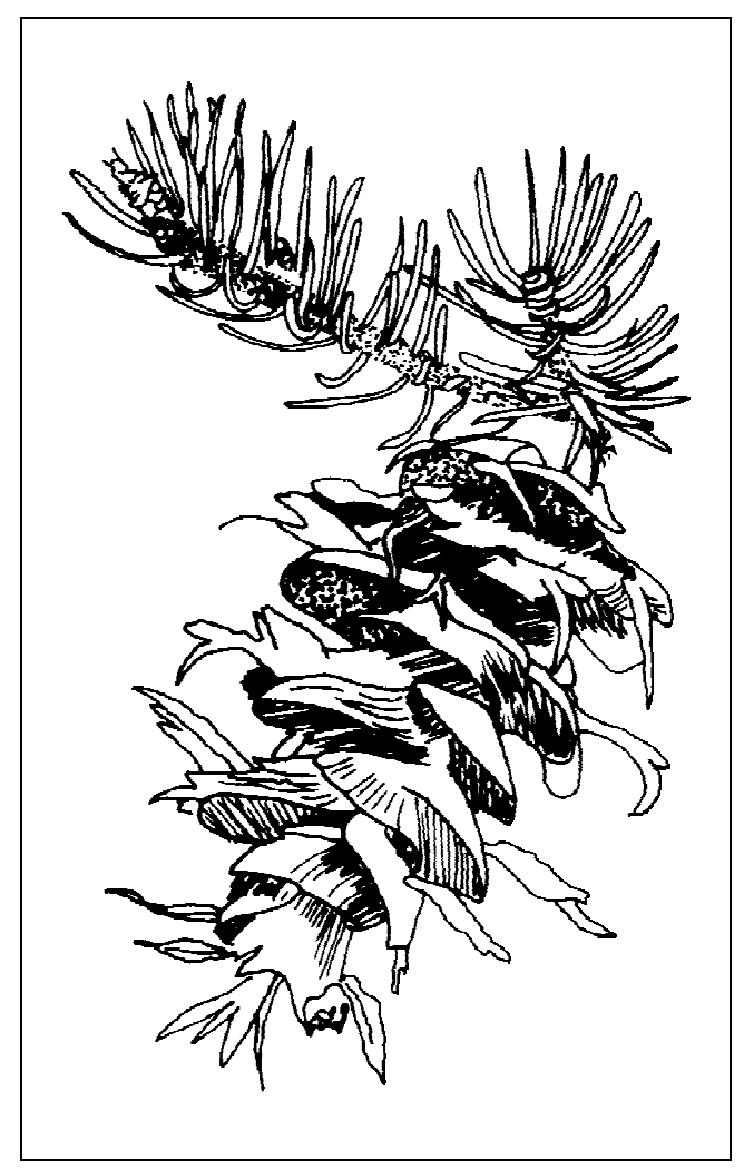
Figure 3. Foliage of Douglas-fir.