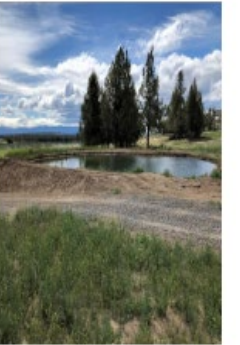
After: Completed Irrigation pond.