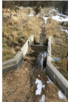
Before: Existing turnout to private landowner property. Wooden boards were used to divert water to property.