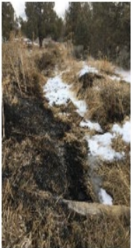
Before: Turnout from COID main canal. Broken headgate promoted sediment build up overflowing irrigation water to neighboring field and threatening well heads.

This grant added a new water control structure and added 980 ft of pipe to an open ditch that serviced two private properties. This project was completed in the fall of 2020.