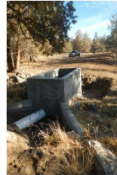
After: Concrete diversion Box installed with slide gate to control water to property.