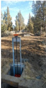
After: New headgate and concrete weir box structure (background).