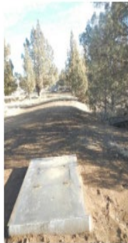
After: Close up of concrete box structure with safety lid.