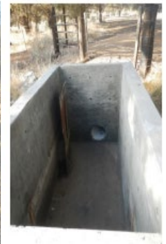
After: Diversion box showing outlet and slide gate (left) to property.