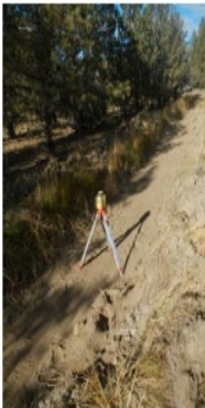
During Construction: Existing ditch was cleaned and set on grade. 10 inch PVC gasketed pipe was installed with 36 inch of soil cover over the pipe. Area was seeded to native seed.