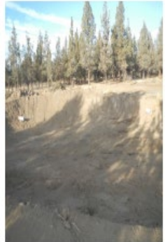
After: New pond and liner was constructed to eliminate flood irrigation.