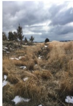
Before: 820 ft of ditch and pond was decommissioned.